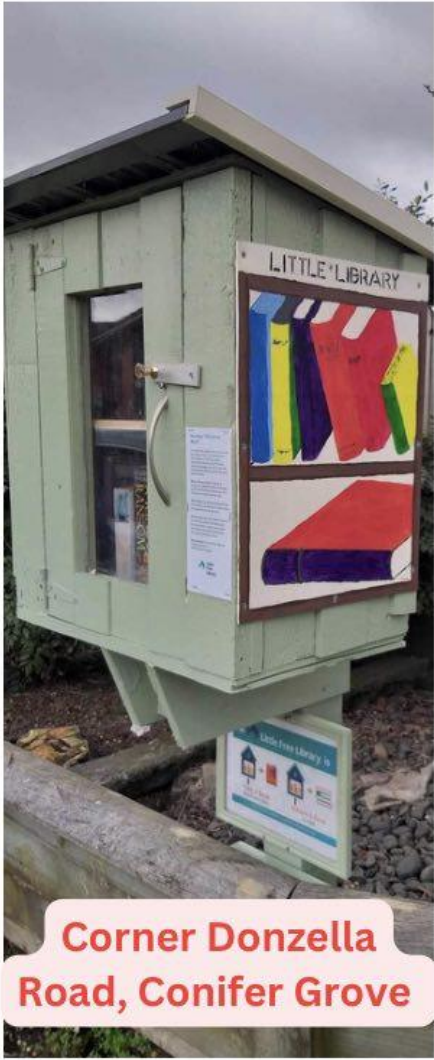
Corner Donzella Road, Conifer Grove