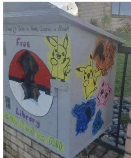
42 Ploughmans Rd, Pukekohe